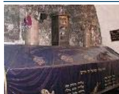
King David's Tomb Israel news photo