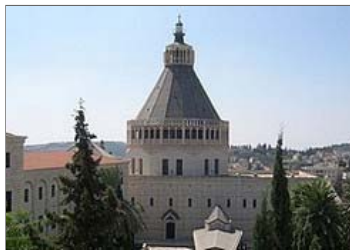
The Church of the Annunciation in Nazareth.